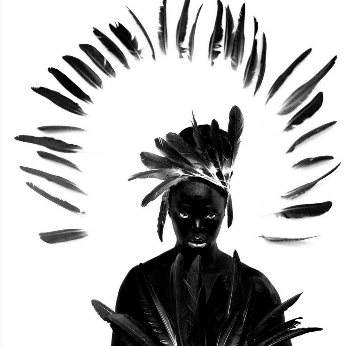
Zanele Muholi's Vumani I, Boston (2019)

The busy fourth edition of AKAA—Also Known as Africa, which closed today at the Carreau du Temple in Paris, reinforced its commitment to showcasing contemporary art from Africa and the diaspora while remaining a discovery fair.