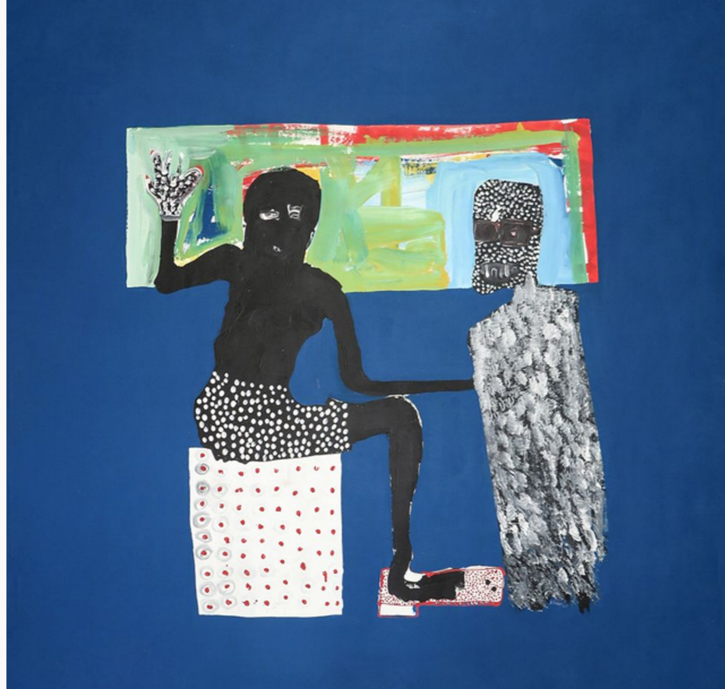
Amadou Sanogo's Autoportrait au pluriel (2017)

The fair features 45 exhibitors from France, other European countries and Africa, yet one American curator, speaking off the record, lamented that AKAA was lacking the participation of galleries such as Stevenson (based in Cape Town and Johannesburg) and Mariane Ibrahim (Chicago), which have been participating in concurrently-held Paris Photo.